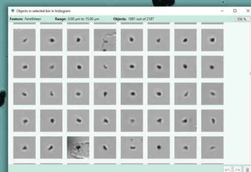
Detection of Dusty Particles