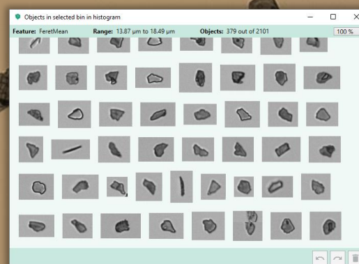
Document Residual Particles