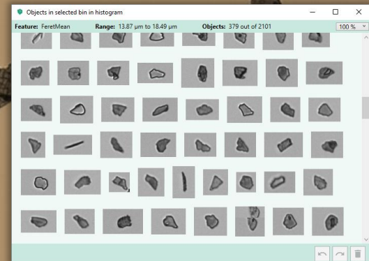
Document Residual Particles